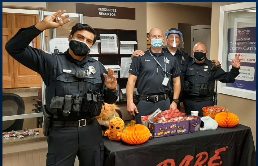
Streamwood D.A.R.E unit and the Hanover Park Police joined our friends at Hanover Township for a fun community Halloween night.